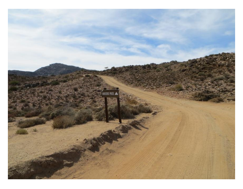
Start off Akkedis Pass.

Traveling through the Akkedis Pass was also a nice experience. It is not the most challenging pies off road I have travelled, but it was a nice change off cinerary. It was no problem off course for the Patrol. I can however see that there will be a problem passing if two vehicles with trailers or caravans coming in opposite directions meet on the pass. It is quite narrow with very little places to pull off the road.