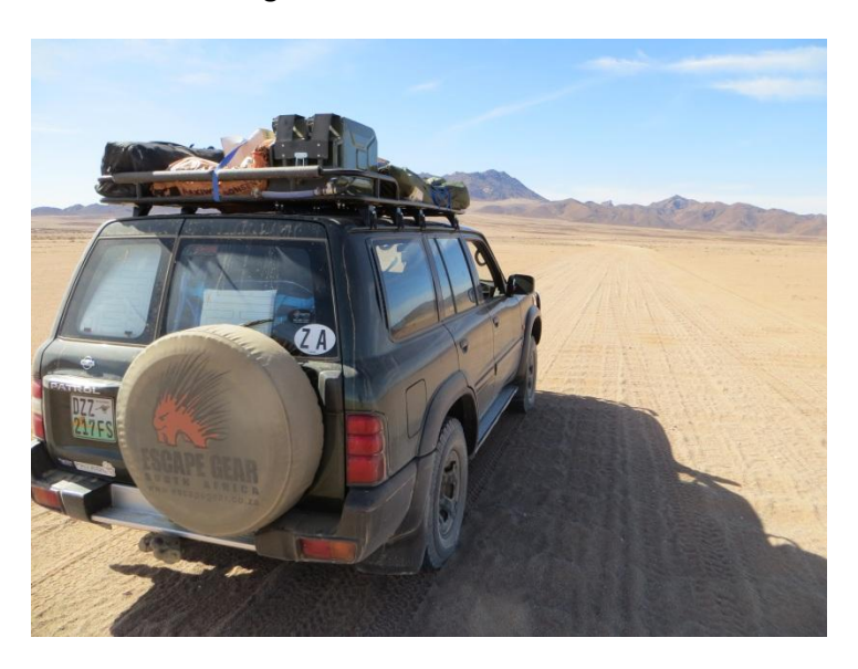
Road to Kokerboomkloof