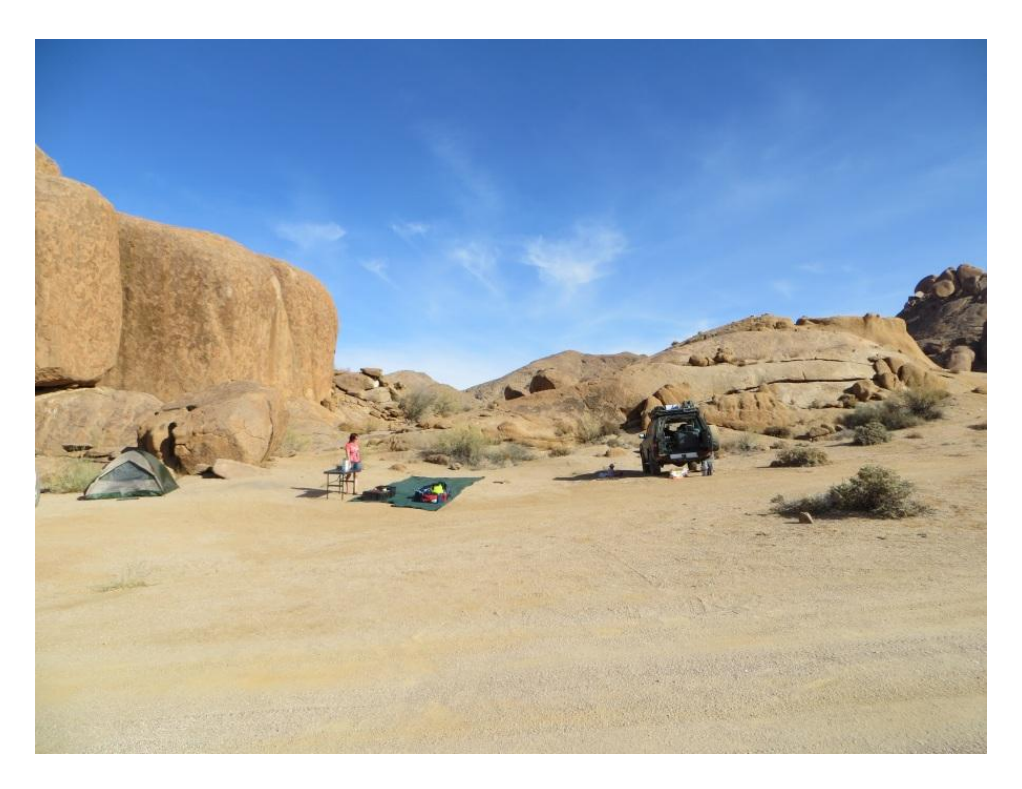
Starting to put up out tent.

Once we arrived at Kokerboomkloof it was difficult to get a nice campsite. Most of the sites were occupied at all four campsites or ablution facilities. We ended up joining a group from Stellenbosch at campsite 3. Here we realized that the park is busy because off the long weekends. This is also the site were we will spend two nights and not one like the other campsite. We pitched our tent and gazebo on the most level spot we could find. There is not a lot off level spots at Kokerboomkloof. It is ideal for caravans, trailer with rooftop tents or vehicles with rooftop tents, but for a tent pitched on the ground it is a bit difficult to find a spot that is level. There are no trees, so do not even try this in the summer. You will have sun somewhere in the day and it will be very hot. You have to find shade behind the boulders here.