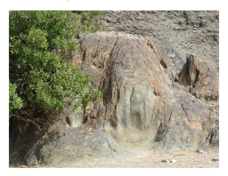
Hand off G.o.d.

One off the experiences off touring with a baby was that we could not get out of the car at the Hand off G.o.d. We were afraid off waking here. She was taking her morning nap at this stage. But we got our photo off it and was soon on our way again