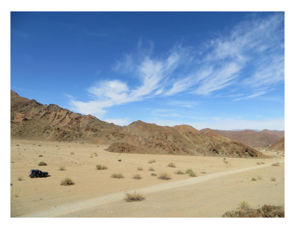
Lunch time on road to Kokerboomkloof.