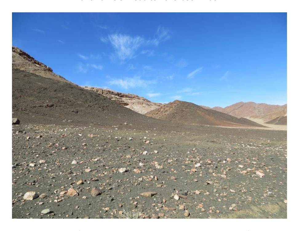
Some of the landscape on the way to Kokerboomkloof

Some sections on the road are soft sand in ancient river beds. There is heavy corrugation on some sections. It is also nice seeing the "toon" off Kokerboomkloof from afar. You can see the "toon" in the distance in the picture below.